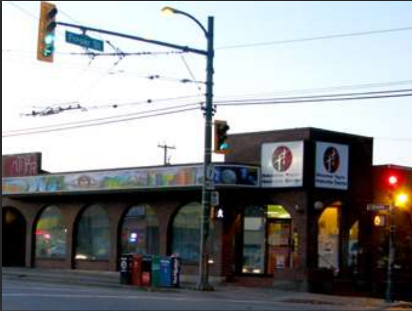
Old BYRC building ; deconstruction and demo