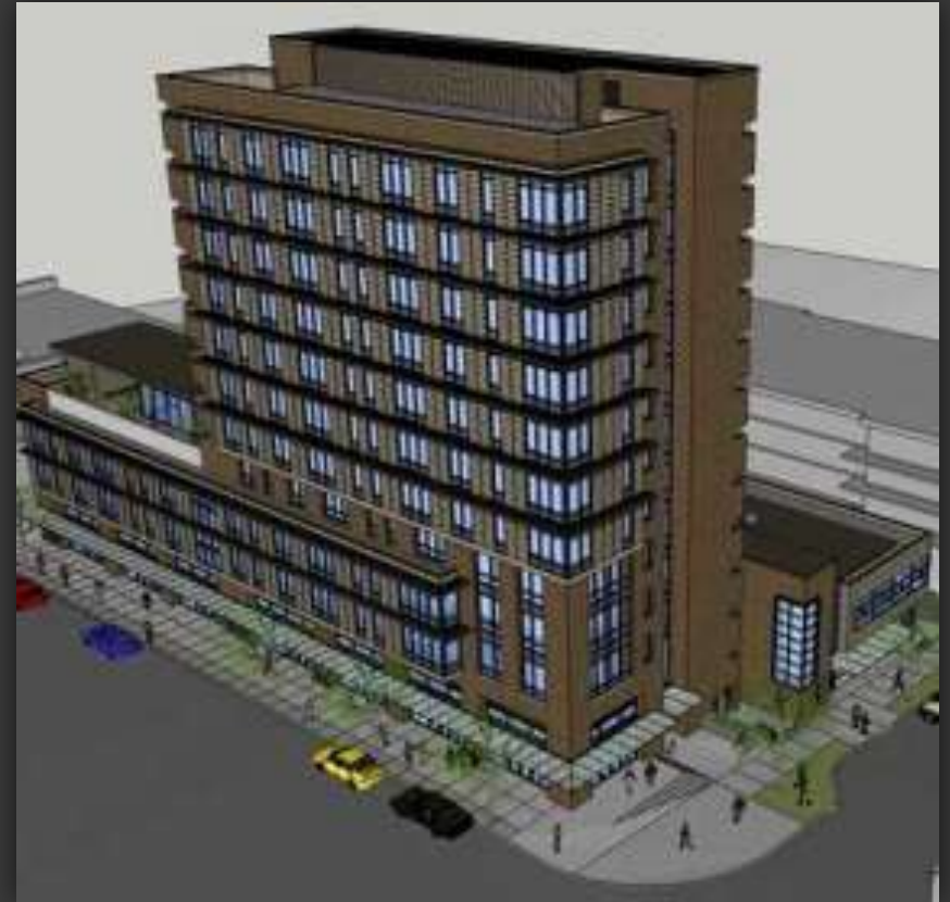
New BYRC with supported housing ; LEED certified